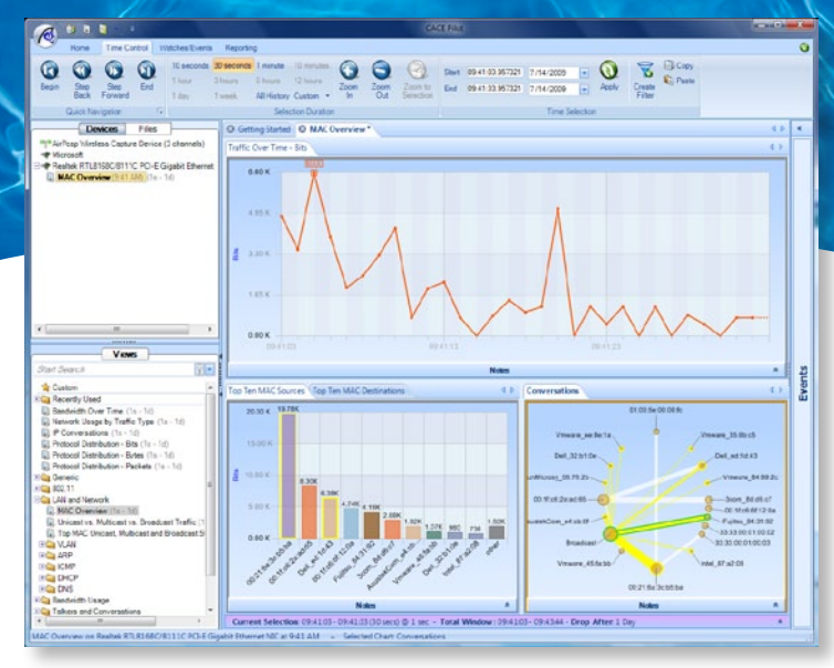
CACE Pilot's Interactive and Visually Oriented User Interface

files by isolating interesting portions of the trace file using CACE Pilot's Adaptive Analysis Engine. The Wireshark capture and display filters are available within CACE Pilot as well as Wireshark's prodigious dissector library for deep packet analysis.