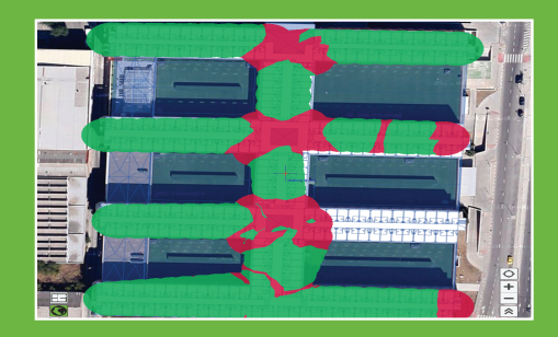
Wi-Fi quality per area