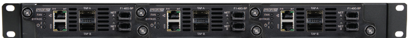
3 x F1-40G-BP IN 1U RACKMOUNT