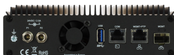
IOTA 10 CORE+ Rear