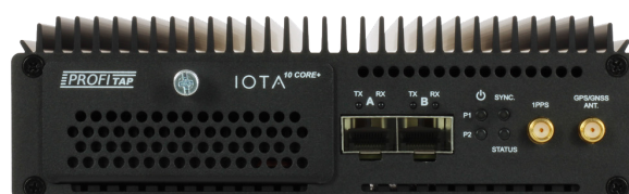
IOTA 10 CORE+ Front