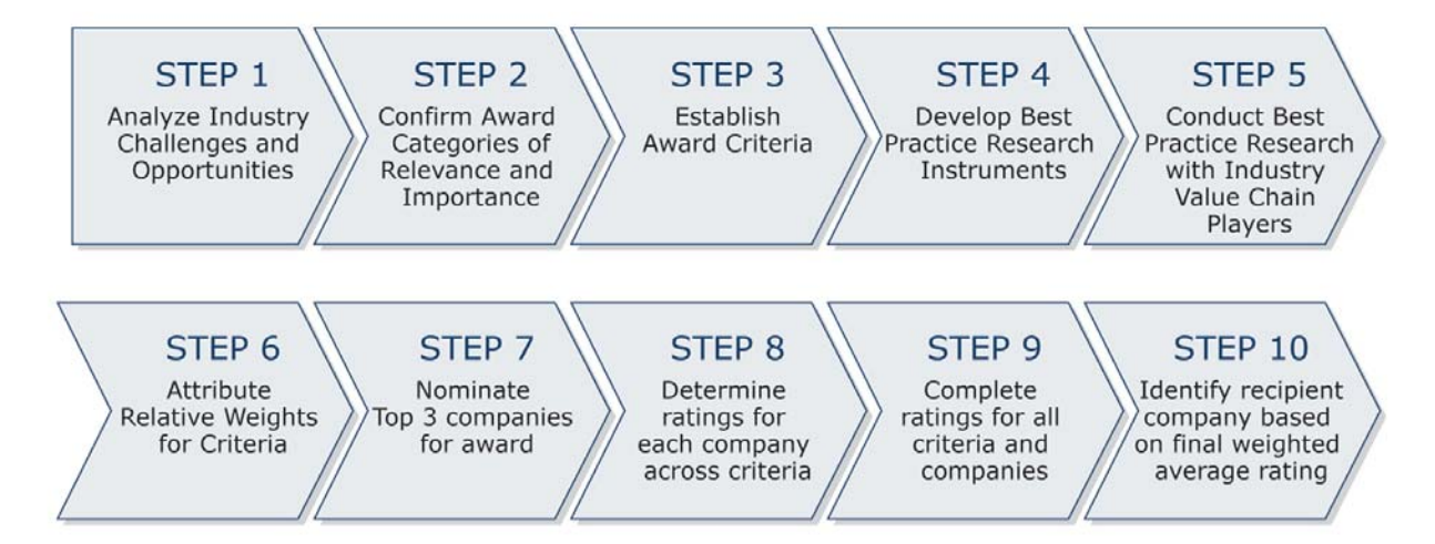
Chart 2: Frost & Sullivan's 10-Step Process for Identifying Award Recipients

changes to the ratings for a specific criterion do not lead to a significant change in the overall relative rankings of the companies.